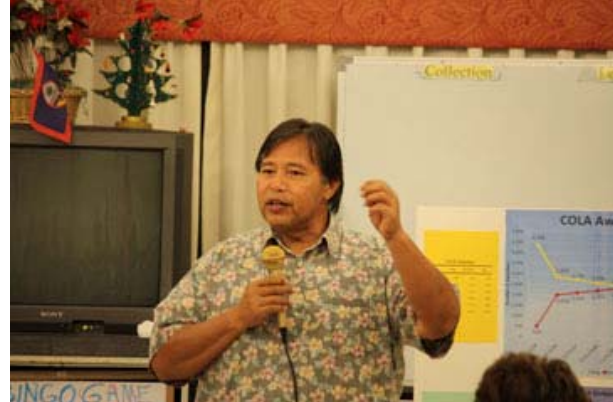
Senator Pangelinan speaks to retirees on COLA at the Mangilao Senior Citizens Center on Sept. 11, 2010.